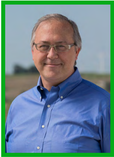
REPUBLICAN - VAN METER