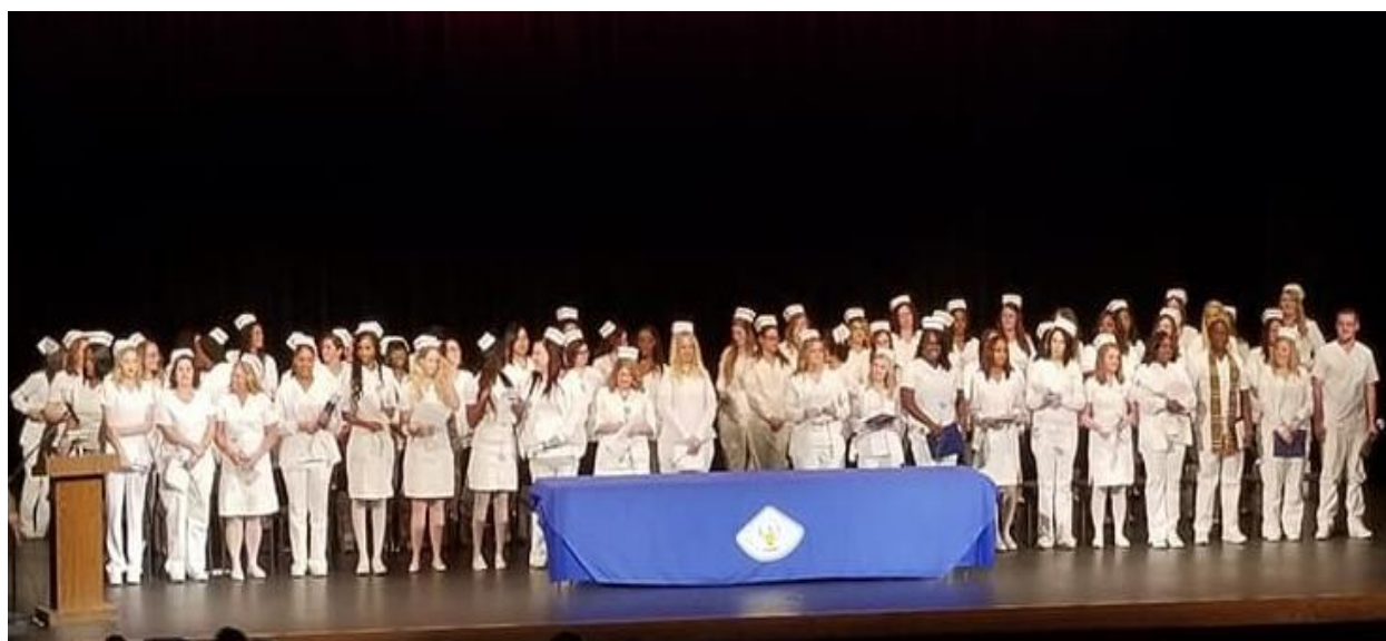
Graduation Ceremony Class 120

Graduates and any students in the ceremony must wear the regulation white school uniform unless prior approval has been made with the Nurse Administrator. Those not in the regulation school uniform will not participate in the graduation ceremony without prior approval. Students and others who appear under the influence of alcohol or drugs will be barred from the ceremony and will be subject to the school policy regarding the incident.