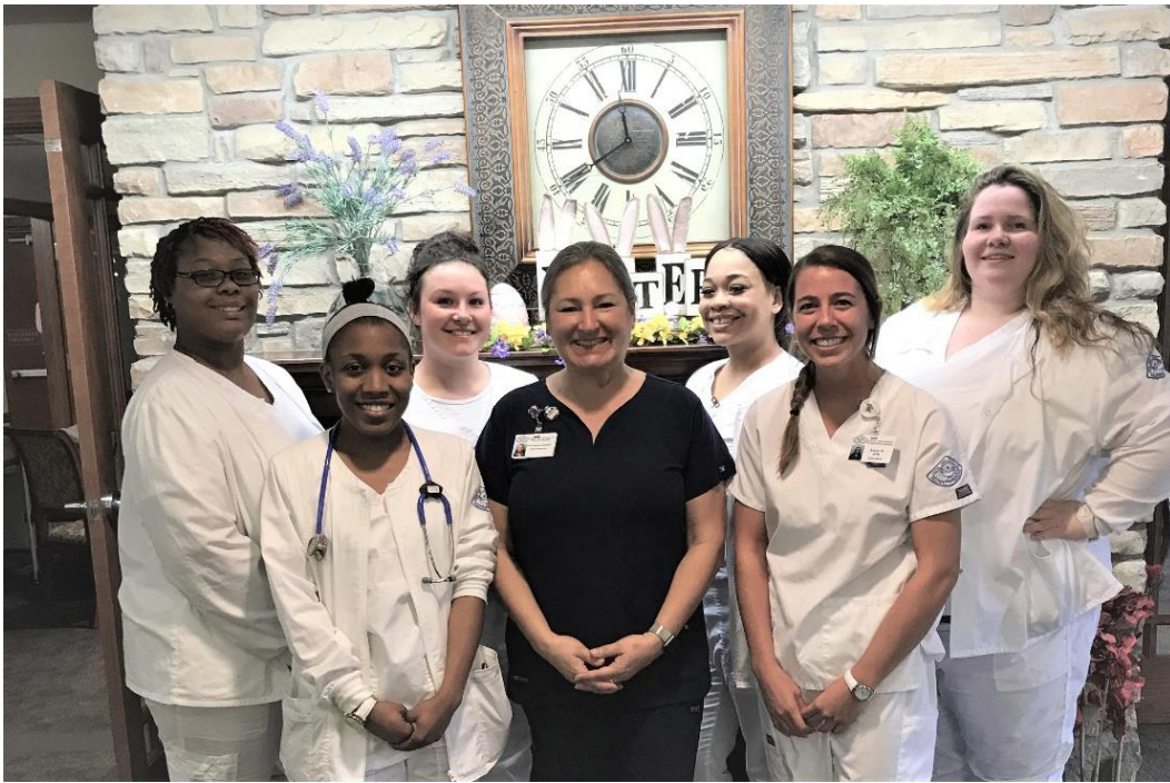
Clinical Group Class 124