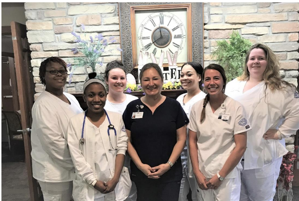
Clinical Group Class 124

Students will not be able to refuse any assigned clinical site, instructor or clinical assignment. If there is a problematic situation, the student should discuss it with the clinical instructor, Clinical/Skills Lab Coordinator or Nurse Administrator. A student who contacts a patient after completing their assigned care is not demonstrating professionalism and may be considered in violation of that patient's confidentiality. Students may not develop personal relationships with patients in any setting, including but not limited to email and social networking sites. For confidentiality issues, students must advise the instructor if they are assigned to provide nursing care to an acquaintance, friend, or relative. Students may not visit friends, relatives, or former patients during clinical hours. Students may not receive visits from friends or relatives in the clinical area during clinical hours, including break and mealtimes.