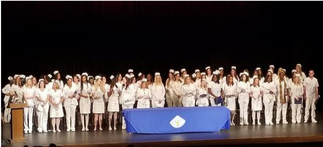
Graduation Ceremony Class 120

Graduates and any students in the ceremony must wear the regulation white school uniform unless prior approval has been made with the Nurse Administrator. Those not in the regulation school uniform will not participate in the graduation ceremony without prior approval. Students and others who appear under the influence of alcohol or drugs will be barred from the ceremony and will be subject to the school policy regarding the incident.