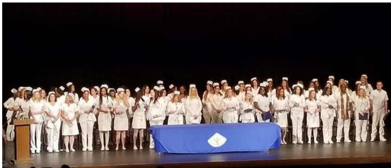
Pinning Ceremony Class 120

Graduates and any students in the ceremony must wear the regulation white school uniform unless prior approval has been made with the Nurse Administrator. Those not in the regulation school uniform will not participate in graduation ceremony without prior approval. Students and others who appear under the influence of alcohol or drugs will be barred from the ceremony, and will be subject to the school policy regarding the incident.