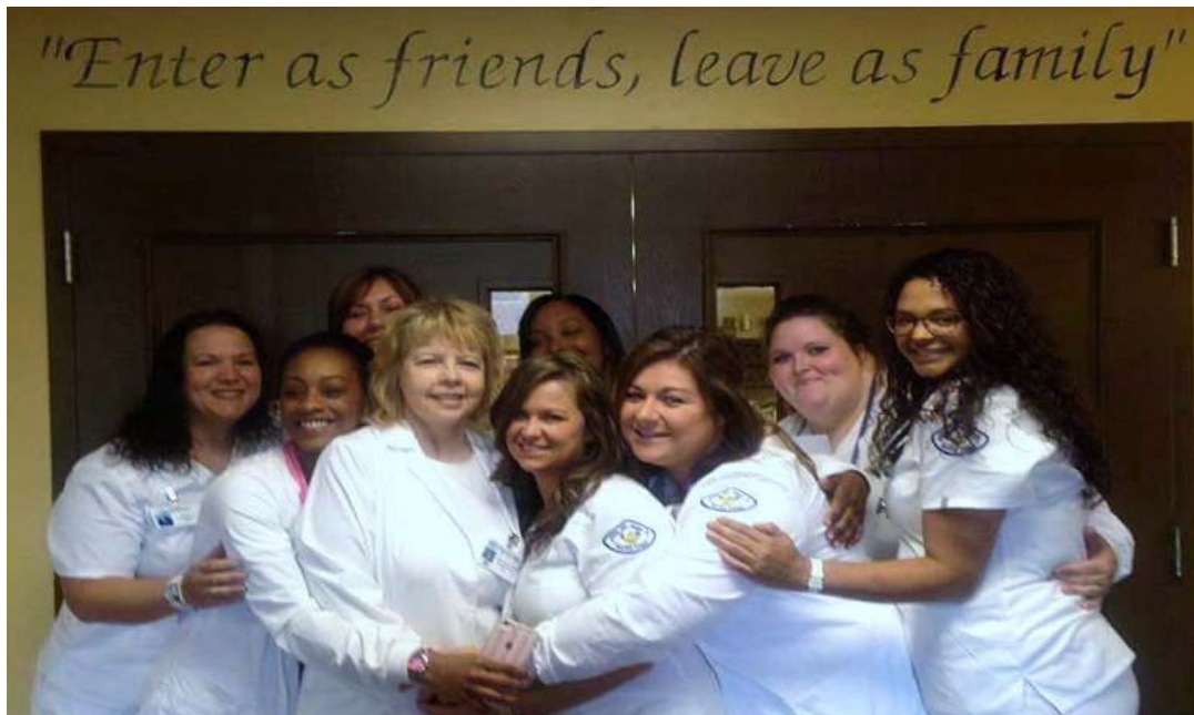
Clinical Day Class 118