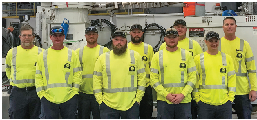
On April 12, our dedicated lineworkers deserve all the appreciation and accolades that come their way on Lineworker Appreciation Day.

"Lineworker" is listed as one of the top 10 most dangerous jobs in the U.S. This is understandable as they perform detailed tasks near high-voltage power lines.