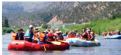
Each year, campers go rafting during Cooperative Youth Leadership Camp in Steamboat Springs, Colorado, which next year is scheduled for July 12-18, 2019.

and the Washington Monument. To see what's in store, visit http://bit.ly/dcytvideo2015 .