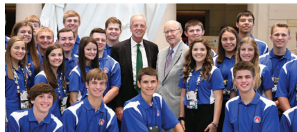
During the Electric Cooperative Youth Tour to Washington, D.C., students meet with our elected officials. Next year's tour will be June 13-20, 2019.

Imagine—a chance to visit our nation's capital for one week, meet with more than 1,800 students from across the U.S. and visit with Kansas' senators and congressional representatives. Ninnescah will choose one winner to go to the Electric Cooperative Youth Tour in Washington, D.C., from June 13-20, 2019. The week-long trip to Washington, D.C. is jam-packed with sightseeing. Students will visit many of the major monuments and memorials, including the Lincoln Memorial, the Jefferson Memorial