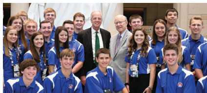
During the Electric Cooperative Youth Tour to Washington, D.C., students meet with our elected officials. This year's tour will be June 13-20, 2019.

During both trips, students forge lifelong friendships and many become college roommates and professional colleagues. Most importantly, these youth programs inspire students to discover who they want to be.