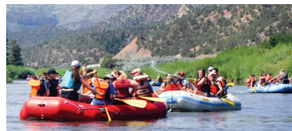
Each year, campers go rafting during Cooperative Youth Leadership Camp in Steamboat Springs, Colorado, which is scheduled for July 12-18, 2019.

Imagine—a chance to visit our nation's capital for one week, meet with more than 1,800 students from across the U.S. and visit with Kansas' senators and congressional representatives. Ninnescah will choose one winner to go to the Electric Cooperative Youth Tour in Washington, D.C., from June 13-20, 2019. The week-long trip to Washington, D.C. is jam-packed with sightseeing. Students will visit many of the major monuments and memorials, including the Lincoln Memorial, the Jefferson Memorial