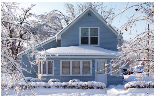
The CWR ensures you will have electricity in your home this winter. You must make pay arrangements with Ninnescah Electric Cooperative to use the CWR.