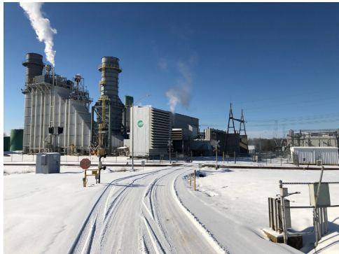
The Thomas B. Fitzhugh Generating Station operated on fuel oil reserves at the peak of the severe winter temperatures to shield electric cooperative members from skyrocketing natural gas costs.

Because of the soaring demand for natural gas, prices skyrocketed as supplies grew tight. The unusually high cost of natural gas used to generate electricity was the primary driver behind the higher-than-normal electric bills many members are receiving. Although AECC has a diverse mix of generation supplies to help lower fuel costs, a large portion