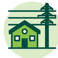
STEP 4: PRIORITIZE REPAIRS