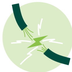
STEP 2: ADDRESS SAFETY RISKS