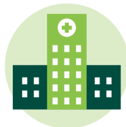
STEP 3: RESTORE ESSENTIAL SERVICES